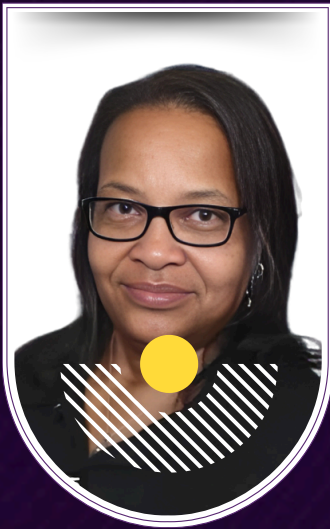
Head Admissions Counselor

with a Bachelor's in Christian Counseling, our Head of Admissions works with students to ensure a healthy and effective school experience. Managing the admissions counselors, this team speaks to students and hears first hand of their concerns, needs and compliments. This team is here for our students.