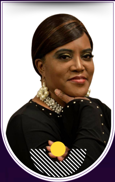
Dean Of Academics

With a Doctoral Degree in Theology, a Masters in Christian Counseling, a Masters in Special Education, and a Bachelor's in Psychology, our Dean of Academics cares for the educational goals and doubles as an Instructor as well. Her classes are teaming with knowledge and infused with her gifting's as well!