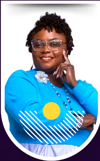
Dean Of Academics

With a Doctoral Degree in Christian Counseling, a Masters in School Administration and a Bachelor's in English Literature, our adjunct instructor passionately equips students to explore the biblical mandate to make disciples through a lens of purpose, clarity, and global relevance.