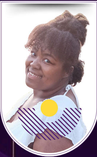
Recruitment Team Manager

With a Doctoral Degree in Theology & Religious Vocations, our Recruitment Team Manager is tasked with marketing and retention of new students. Also, an adjunct instructor, our RTM is a blessing to PWU!